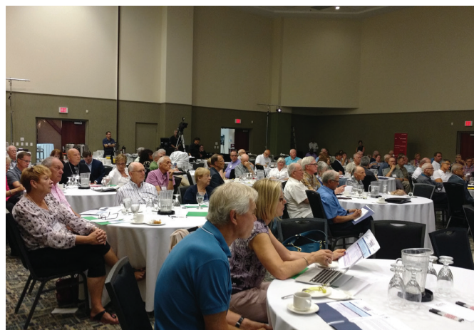
More than 100 people participated